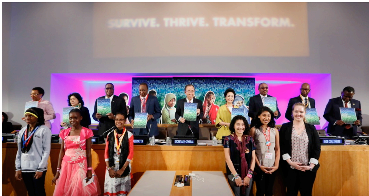
High Level Public Private Partnership Panel

To further support the 6 County Initiative, UNFPA is spearheading an innovative private sector collective action initiative bringing together private and public sector health care providers and enablers. By engaging with the private sector it has become possible to harness the strength, resources and expertise of the private sector to design, test and scale innovations for improving access, availability and quality of care, as for example by introducing Community Life Centres, Telemedicine and new solutions for Youth Friendly Family Planning information and services.