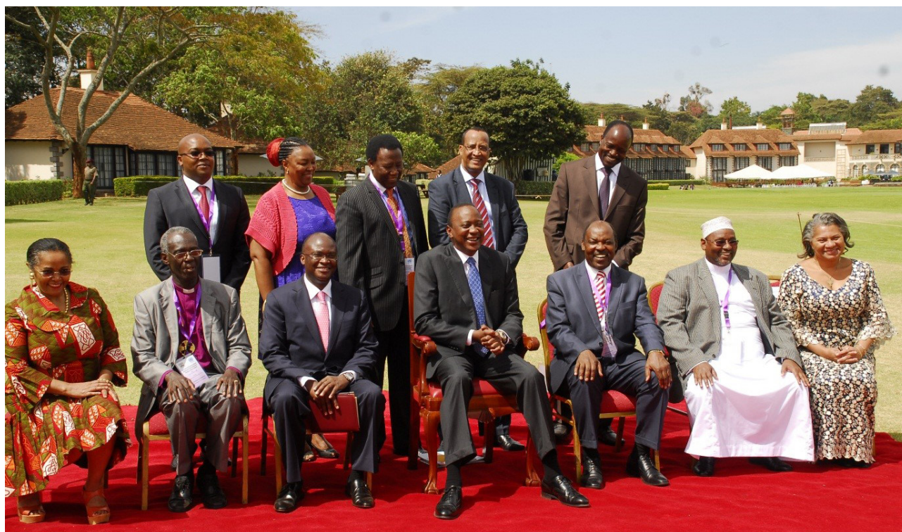
H.E. the President with the Religious Leaders

T his forum opened avenues for dialogue with religious leaders to discuss and address very sensitive issues such as child marriages, family planning, and female genital mutilation/cutting among others.