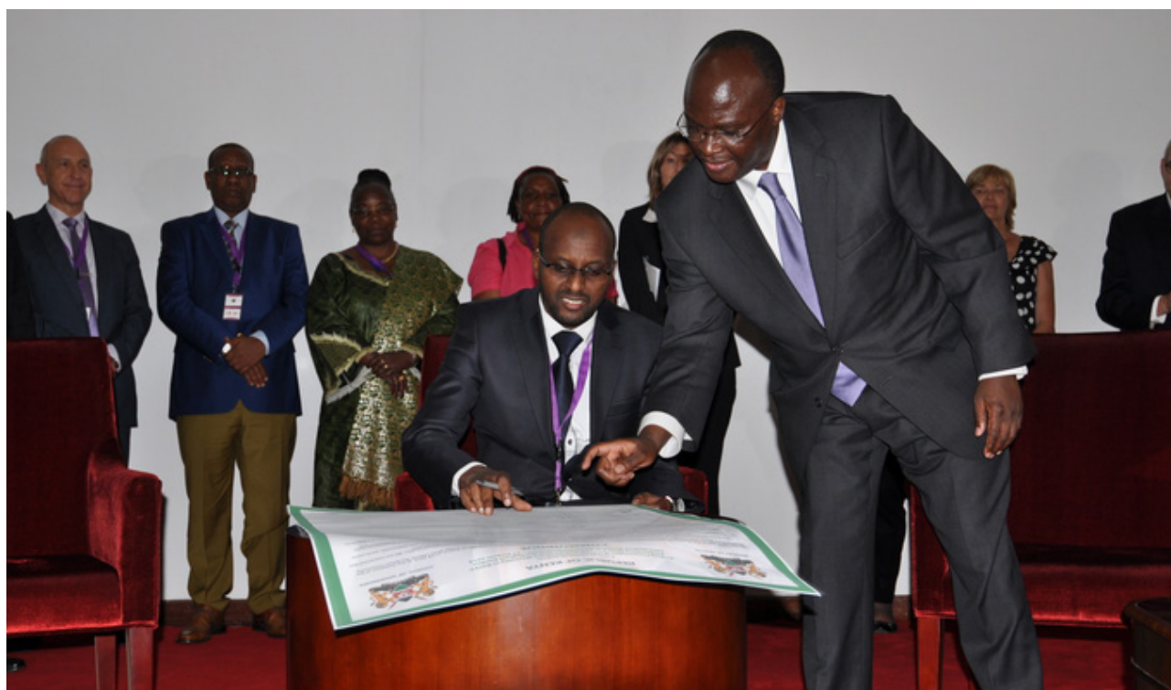
Wajir Governor signs the communique, guided by the former Cabinet Secretary Ministry of Health.

From the two meetings a number of results were achieved. First, they motivated a strong desire, as demonstrated by the Joint Communique, among the highest burden county governors to work towards reducing and ultimately ending maternal and new born deaths. Besides the communique, two year partnership agreements with each of the six highest burden counties of Mandera, Wajir, Marsabit, Isiolo, Lamu and Migori were signed to improve RMNCAH service delivery in the respective counties. Secondly, the meetings successfully demonstrated that national and county governments can work together to address county specific priority issues.