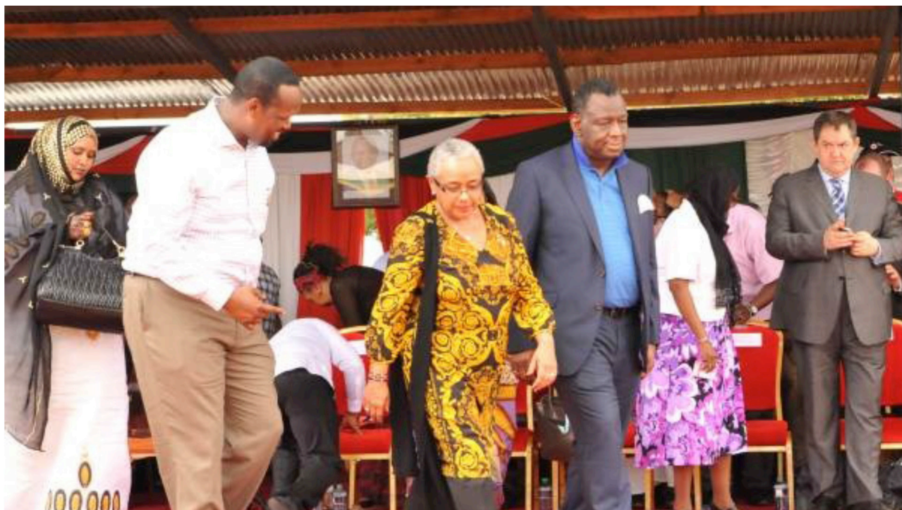
The First Lady and UNFPA Executive Director with the Mandera Governor during their Visit to Mandera

“To us the UNFPA effort has enabled the training of the Community Health Volunteers (CHVs) who in turn train mothers and assist them in seeking skilled help. The CHVs also work together with the Beyond Zero Mobile Clinics to provide health care services for the mothers in the rural areas in Wajir County.” Chief Officer, Health, Wajir County