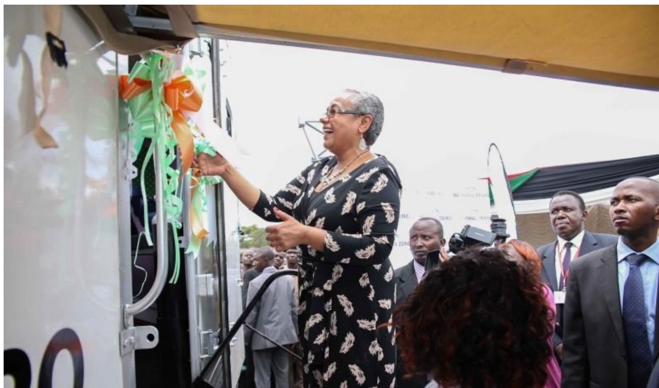
First Lady launching a Beyond Zero mobile clinic/ambulance

The Country Office was also instrumental in nominating the First Lady as the UN person of the year in 2014 for her efforts in advocating for maternal health. This linkage has given UNFPA a unique platform to position the issues of maternal health at the highest level of political leadership and to mobilize support of the key stakeholders from both private and public sectors.